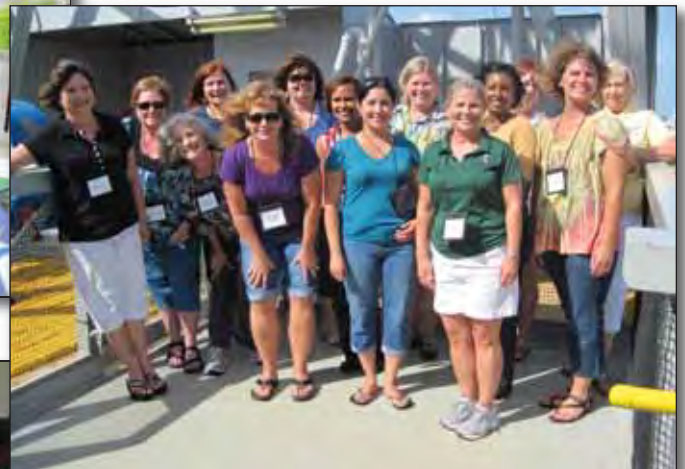
Teachers at a Facilitators Conference on the Ocean Star tour the rig and museum.