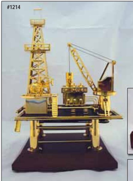
#1214 Animated Offshore Rig Award 8.5" x 10" x 16" $650.00

The Ocean Star gift shop has a great selection of oil themed awards that can be customized for your presentation needs. If you place your order before October 30th and mention this ad; the Ocean Star will provide a customized plaque with up to three lines of text for no charge.