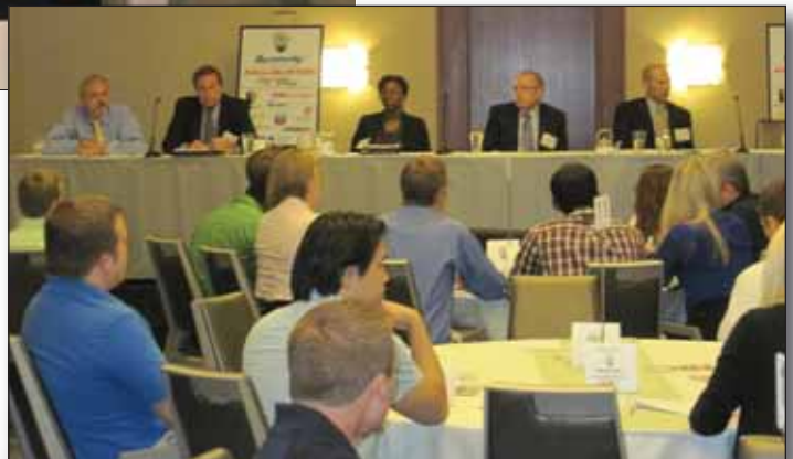
Panelists this year discussed the Life Cycle of Oil & Gas, from seismic to transportation and marketing of the final product.