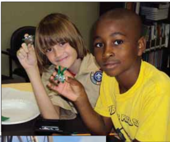
Scouts proudly show off their bugs made during an activity at a Scout Workshop on the Ocean Star in July.