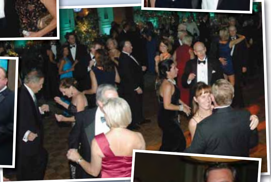
Dancing to the music of Fried Ice Cream.