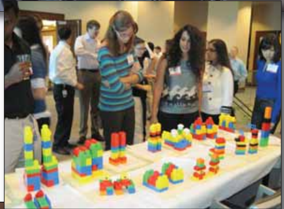
Interns peruse the results of Hear Hear Engineer , an activity from OEC's Project E 3 : Expanding Energy Education, in which one group of interns constructed a structure from Legos, and wrote instructions for a second group to build an identical structure.